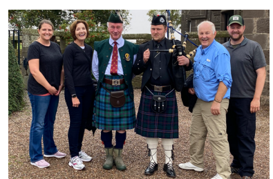
Our Guests Flirting With The Pipers